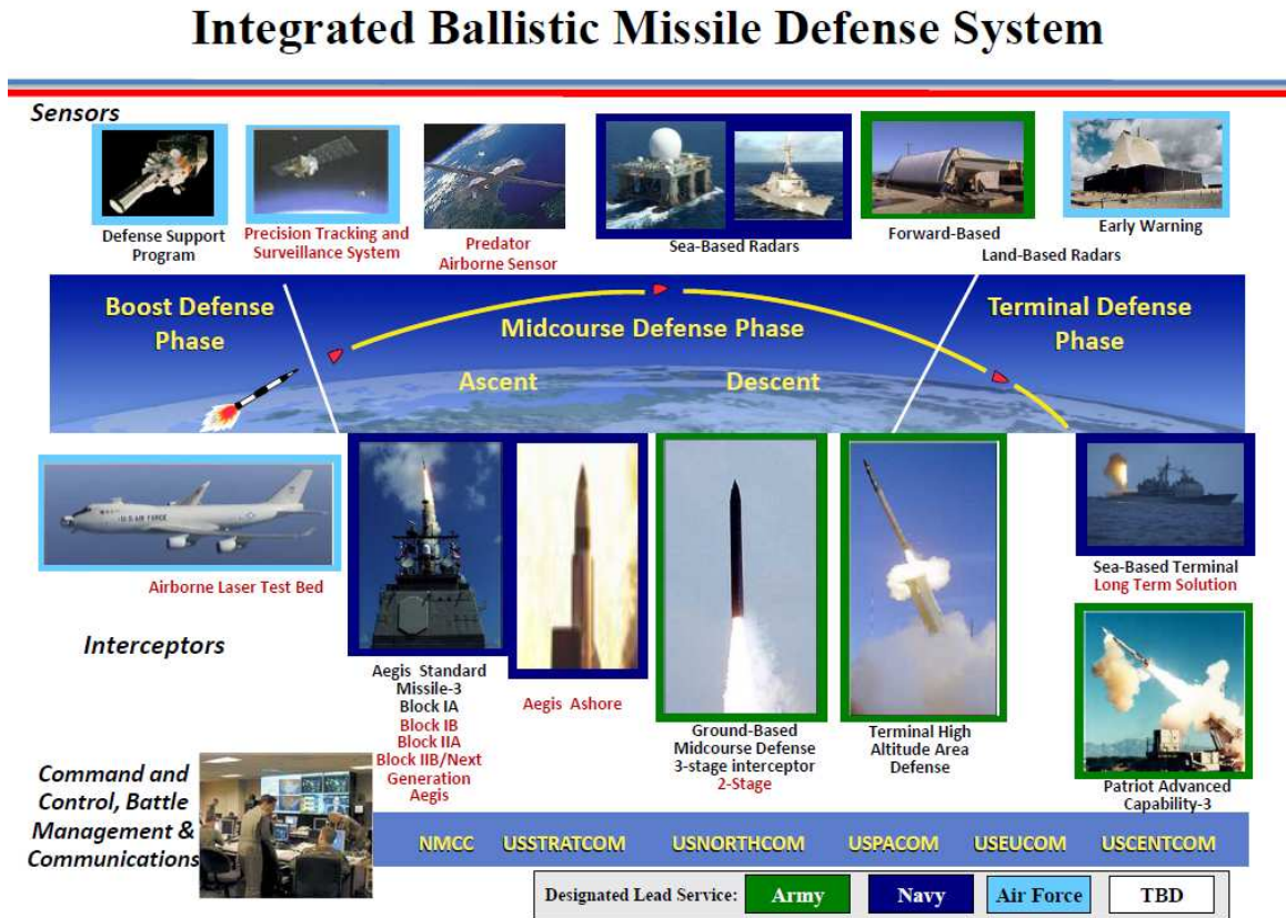
Figure 3 – Current U.S. Missile Defense Systems

In fiscal year 2011, the Missile Defense Agency transitioned its funding for boost phase developments to a program focused on Directed Energy. They intend to use the Airborne Laser Test Bed to push various high power laser programs, while sustaining critical industrial capabilities. Critics of the ABL felt the chemical laser employed by the system was inefficient and costly and pointed toward a rising class of laser technologies that appear to offer significant efficiency improvements. As yet, those laser systems are not capable of producing the amount of power needed to destroy a missile. Nevertheless, directed energy systems have great potential for missile defense missions as well as other defense needs. The MDA Directed Energy Program is structured to